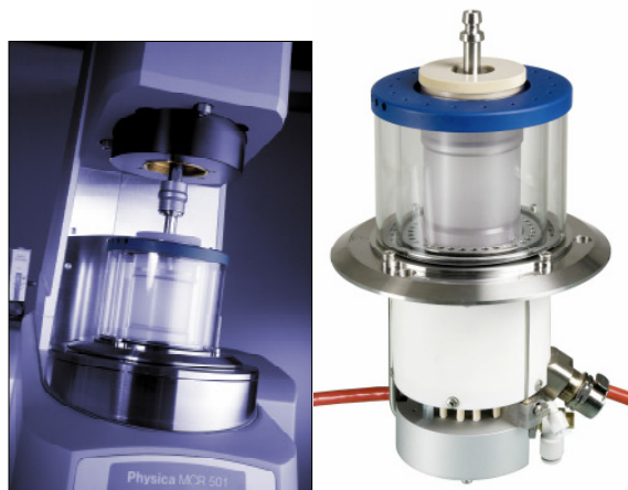
Figure 2. Rheometer with SANS device

rheometer. The Rheometer together with the SANS accessory is put into the SANS beamline. The SANS setup as depicted in Figure 2 is based on a convection principle for temperature control in the range from -100°C up to 200°C.