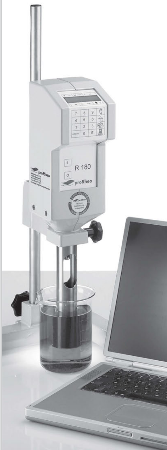
Laboratory Viscometer Process Measurement Technique Service/Consulting

In total, there were twelve key-note lectures, distributed over the scientific sessions, presented at the meeting by a number of distinguished scientists. To-